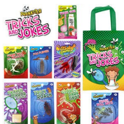
Tricks and Jokes