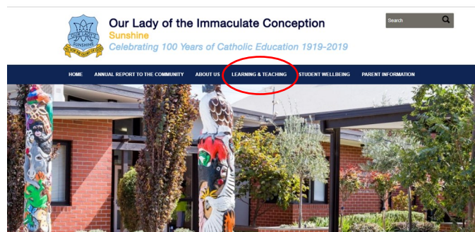
Photo galleries of ALL our special events! Go to Learning and Teaching, Extra Curricula Activities.

Our website is www.olsunshine.catholic.edu.au . Look at what you can find!