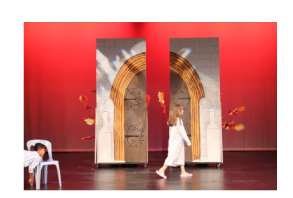
Step Back In Time