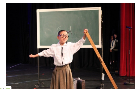
Step Back In Time