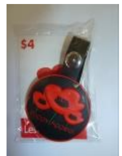
$4.00 bag tag