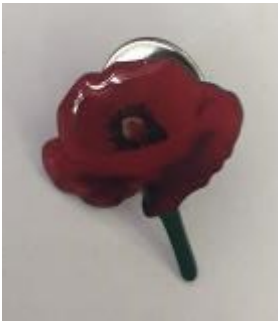
$1.00 poppy pin